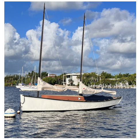
Egret at CGSC