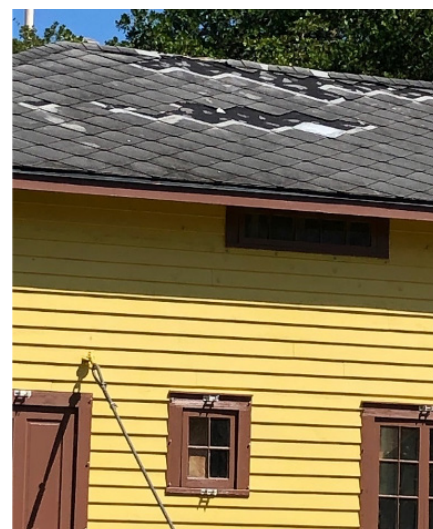
Roof in need of repair