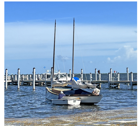
Egret and the Dinghy at Low Tide