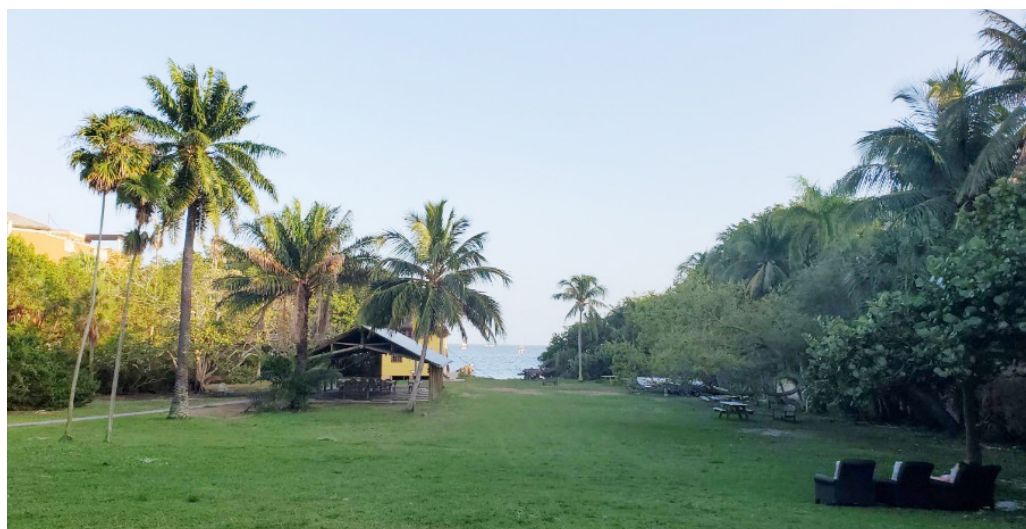
My view from the porch

Last, but not least, please come and enjoy our Barnacle! You can't beat the view from the porch!