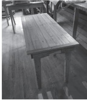
Dade County Pine Folding Table

The Boathouse Crew is busy crafting camp stools, a table, and small sea chests made from "treasure wood." They are hoping to offer some of these items for sale. If you pass by the Boathouse on a Wednesday or Saturday, and it smells like someone just spilled a bottle of "Pine-Sol," you will know that it's only the Boathouse Crew at work, repurposing our salvaged treasure. To become part of our endeavors, walk into the park any Wednesday or Saturday and join the fun!