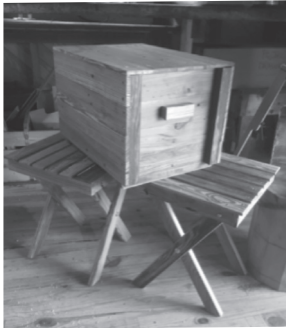
Sea Chest and Camp Stools